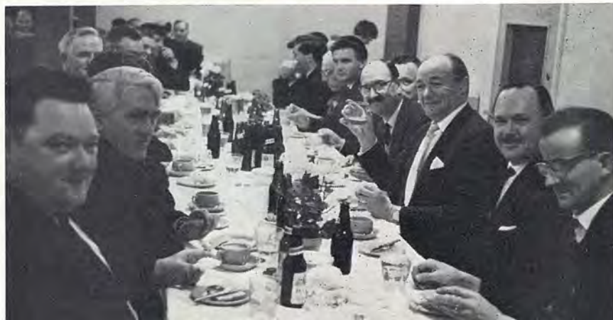
After a hard day's work the delegates ate a hearty meal.