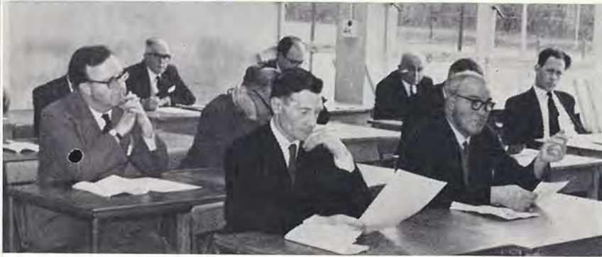
Above, right and below: Three of the study groups in session. The themes under discussion were "Public Relations" and "Consumer Relations".