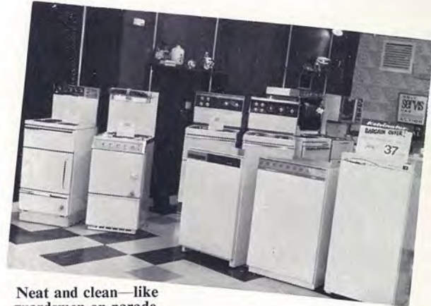
Neat and clean—like guardsmen on parade.