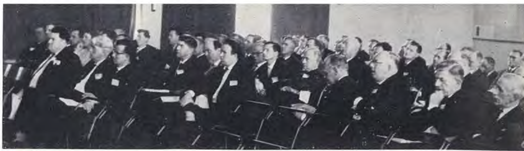
Some of the delegates listening to the Chairman.