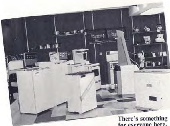
There's something for everyone here.